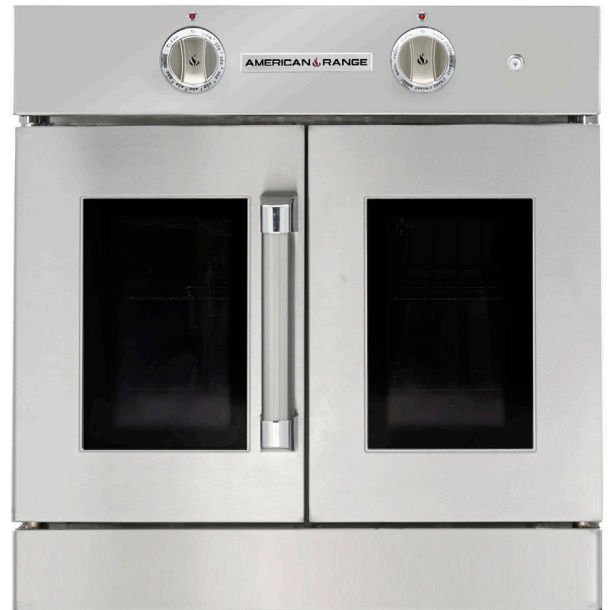
AROFG-30 SHOWN IN STAINLESS STEEL, AVAILABLE IN ANY RAL COLOR

The American Range Legacy Series Wall Oven has helped revolutionize the residential culinary luxury experience. Designed with the user in mind, this oven excels in all areas of the cuisine and culinary experience. It's simple, sophisticated design will look great in any kitchen and is available in hundreds of colors to ensure that it can be the accent or focal point of any well designed kitchen. It's simple control interface makes it fast and easy to operate and set to any mode you like and ensures that you maintain exact control for exactly what you need. Say, "Hello" to the American Range Legacy Series Wall Oven!